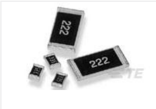
TE Part #4-1879497-4 CRGH1206 5% 62R 0.5W