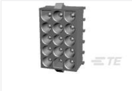
TE Part #350714-1 15P UMNL PIN HDR ASSY 94VO