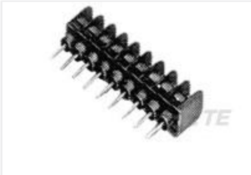
TE Part #2-1546720-8 JC6-E107-03-221=JC6 ASSEMBLY