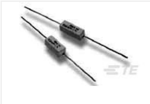
TE Part #1-1623819-5 SBL5 R015 5%