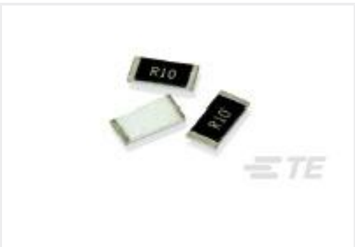
TE Part #1-2176057-4 RLP73M 3A R036 1% 1K RL