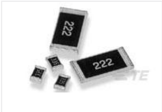
TE Part #5-1879494-9 CRGH0603 5% 270R 0.2W