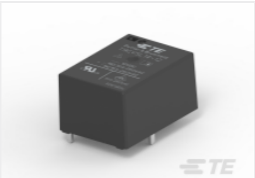
TE Part #1558661-7 T9GV1L14-24