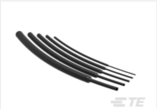
TE Part #NB14634001 VERSAFIT-3X-1/2-0-SP