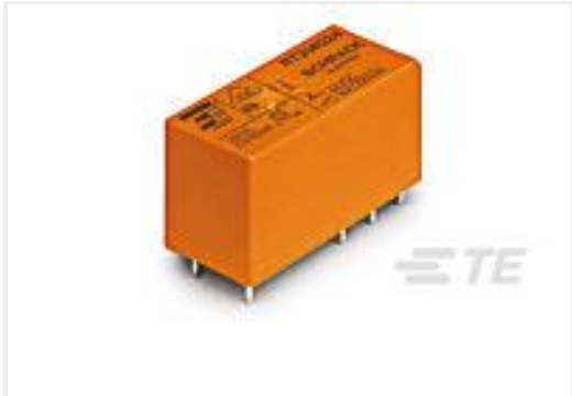
TE Part #3-1393238-0 RTB34012