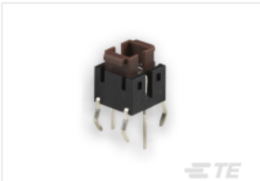
TE Part #4-2213818-8 6X6 ILL TACT THT 260GF HI COLD WHITE