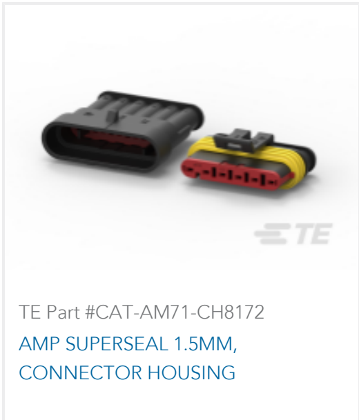
TE Part #CAT-AM71-CH8172 AMP SUPERSEAL 1.5MM, CONNECTOR HOUSING