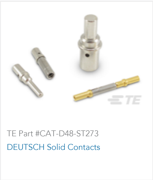
TE Part #CAT-D48-ST273 DEUTSCH Solid Contacts