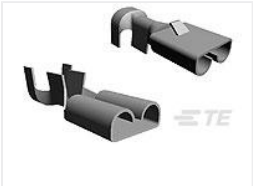
TE Part #280919-4 FF 187 REC 0.5-1.5MM2 TPPB