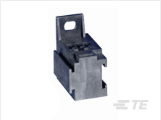
TE Part #1-1904045-5 V23333Z1001B045-EV-100