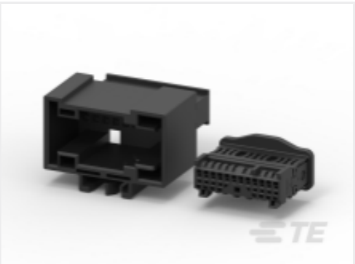
TE Part #CAT-M8793-CH8172 MQS, CONNECTOR HOUSING