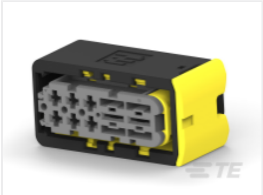
TE Part #2-2299782-1 8POS,MIXED,REC HSG,ASSY,SLD