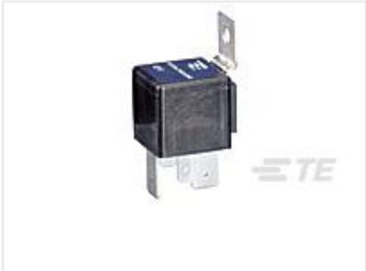
TE Part #1-1414147-0 V23134J0052X429-EV-CBOX