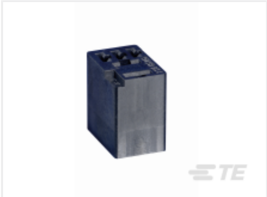
TE Part #1-1904045-6 V23333Z0001B046-EV-100