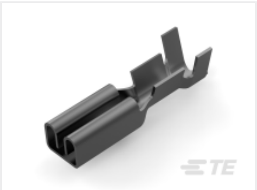
TE Part #925544-2 FF 110 REC 0.5-1.5MM2 PB LP