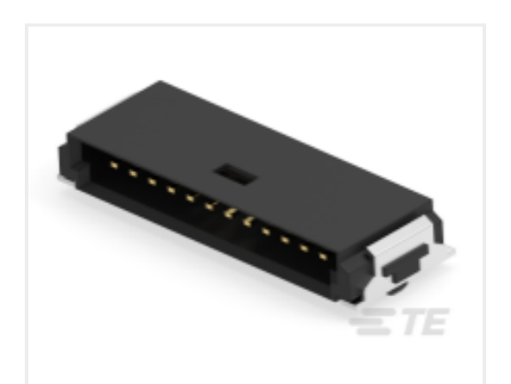
TE Part #234478-E SRCA 1,27 12 M 1 SMD 137 E1 094 * GURT *