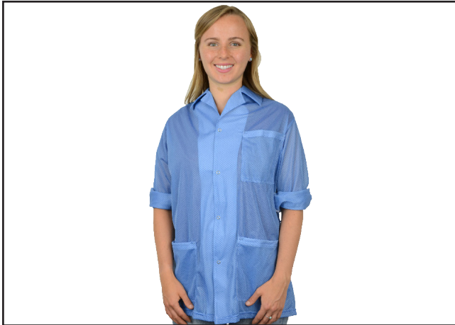
Figure 1. Desco Statshield® Smocks with Convertible Sleeves and Snaps Cuffs.