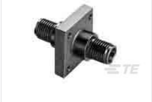
TE Part #858857-1 LGH-1/2L FLANGED RECEPT.

Datasheets & Catalog Pages Miniature General Purpose AC LVDT English