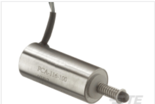
TE Part #02350531-000 GA-HD PCA-116-100 ASSY