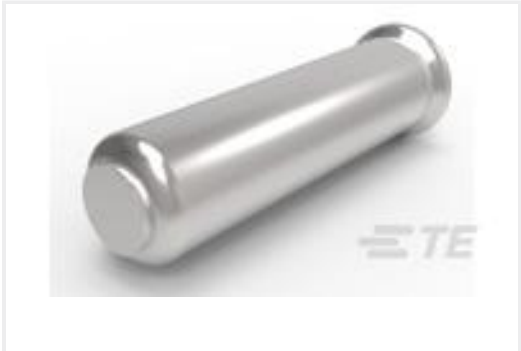
TE Part #3-5331272-5 SOCKET,MIN-SPR SN-AU SER-2