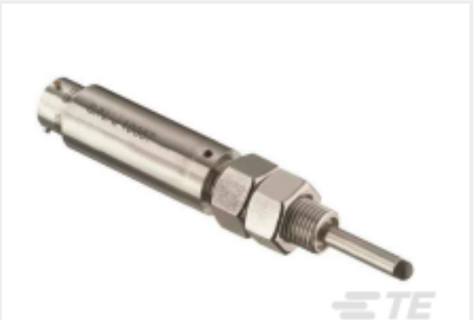
TE Part #02350510-000 GA-HD GCD-121-125 ASSY