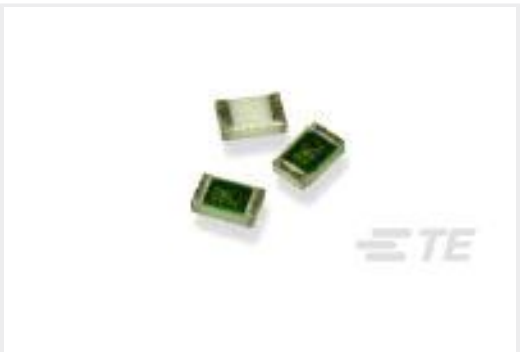
TE Part #7-1614892-8 CPF 0805 6K04 0.1% 25PPM 1K RL