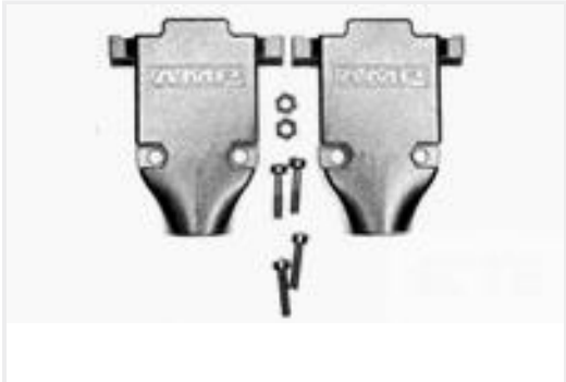
TE Part #5745171-2 SIZE 1 ASSY KIT .200