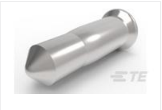
TE Part #5645522-1 MSS, SER 4, W/SEAL,SN-SN,STRIP