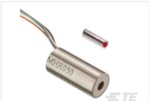
TE Part #02560408-000 LVDT MHR 050 ASSY