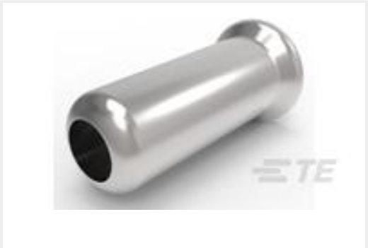
TE Part #5380635-5 REUSABLE COMP RCPT TN SPR8CUP