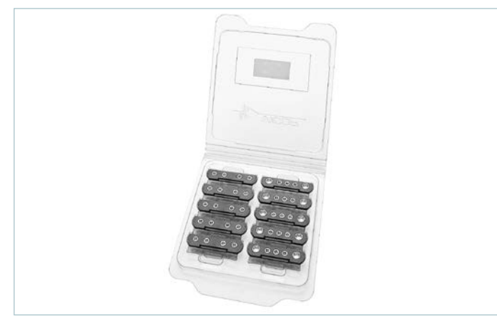
Figure 15.1 — SurfMates; five-pair sets