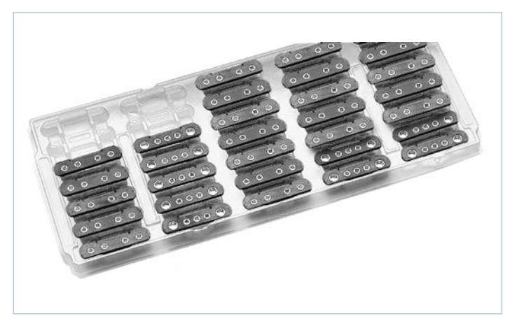
Figure 15.2 — SurfMates; individual part numbers