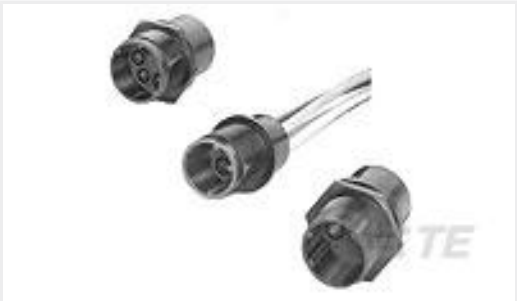
TE Part #859526-4 4 CAV FLANGED RECEPT KIT