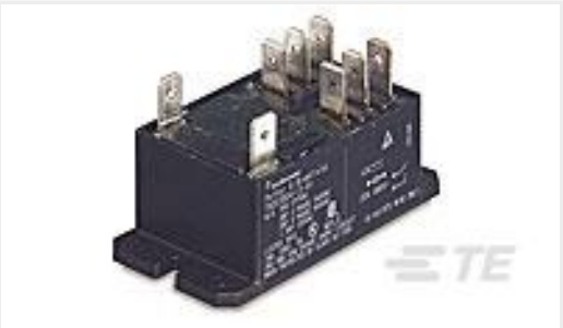
TE Part #8-1393211-9 T92S11D12-12