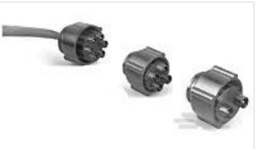
TE Part #860267-1 LGH-6 PIN HV PLUG ASY