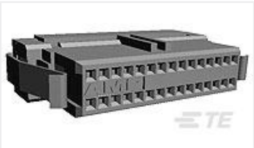
TE Part #1-111196-9 30 RCPT SYSTEM 50, LEAD FREE