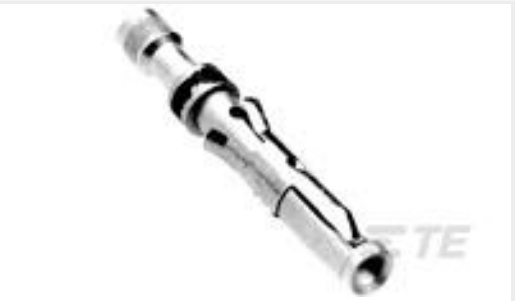
TE Part #201328-1 CONTACT SOCKET ASSY.