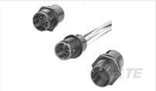
TE Part #861647-6 RECEPT FLANGED H.V. 7 CONTACTS