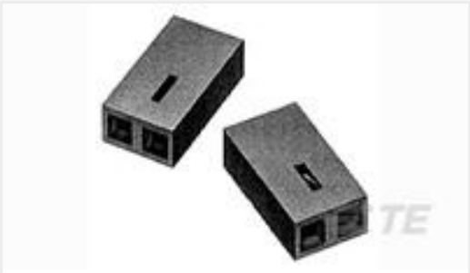
TE Part #4-530153-1 TDM SPRING, SHUNT ASY 2 POS