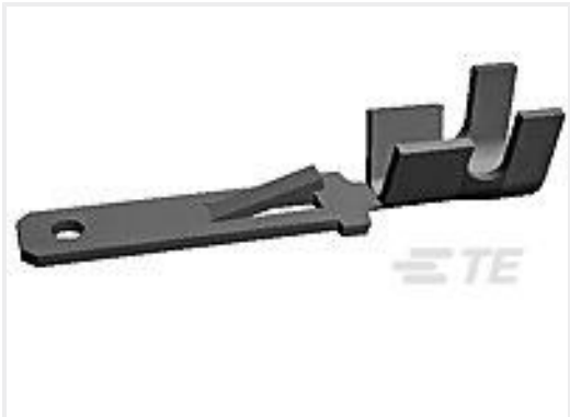
TE Part #62553-3 FF 250 TAB 22-18AWG TPBR