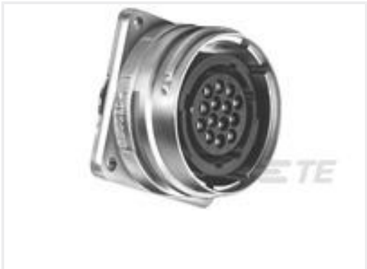
TE Part #208487-1 CMC RECEPTACLE ASSY,SIZE 22