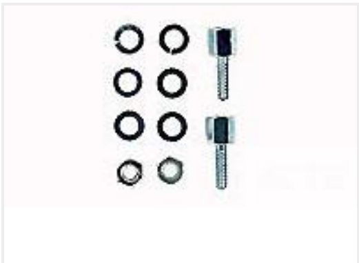
TE Part #5205817-3 FEMALE SCREWLOCK KIT