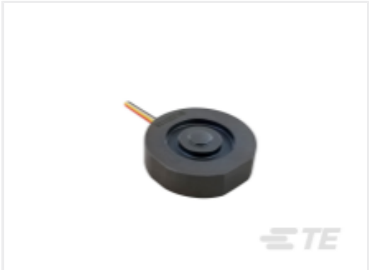
TE Part #20009605-09 FX293X-040B-0025-L