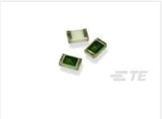
TE Part #6-1614894-9 CPF 0805 976K 0.1% 25PPM 1K RL