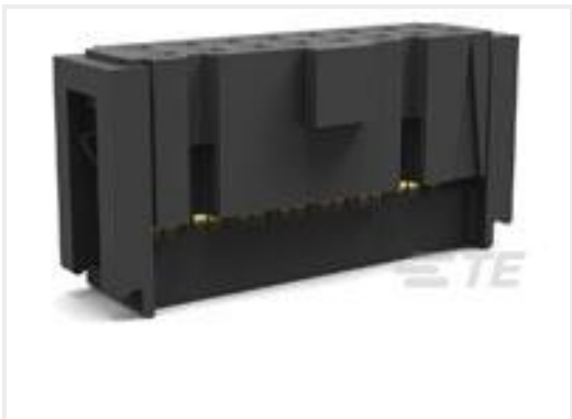
TE Part #1658527-2 622-0630LF FEM SOCKET,LEAD FREE