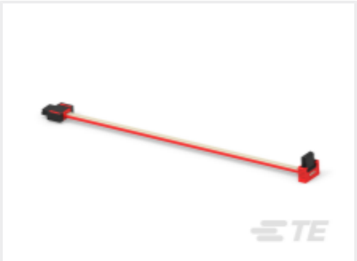
TE Part #839428-E IDCCS SRC 1,27 3 * SPX APU 100 PVC