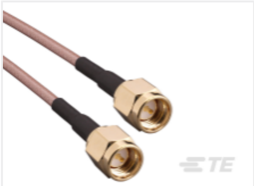
TE Part #CSE-SGAM-610-SGAM SMA to SMA 610mm RG316