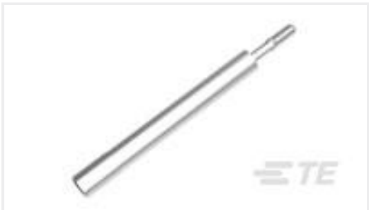
TE Part #747784-8 JACKSCREW KIT,4-40, BULK