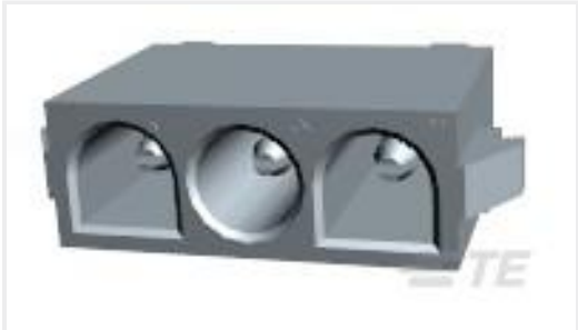
TE Part #350790-3 03P UMNL PIN HDR ASSY 94VO LF