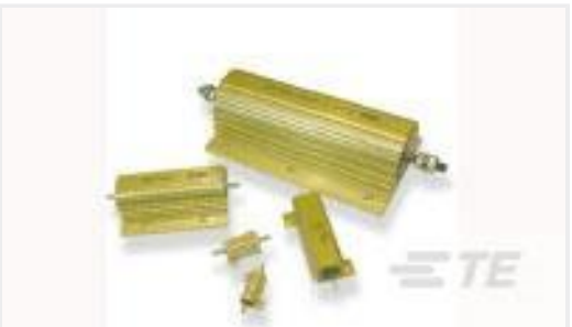
TE Part #2-1625999-1 HSC100 25R 5%