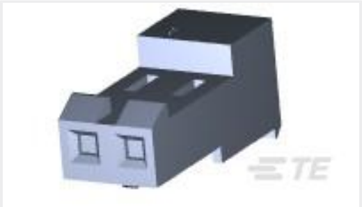
TE Part #3-640428-2 02P MTA156 CONN ASSY 22AWG RED