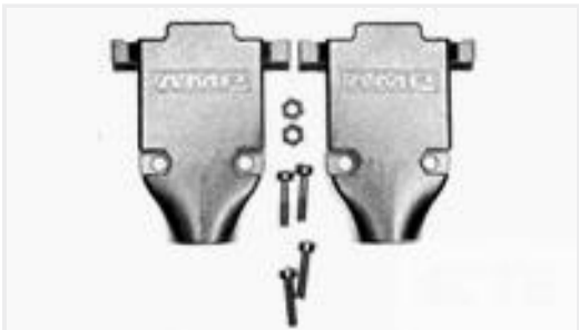
TE Part #1-5745172-3 AMPLI CBL CLMP KIT