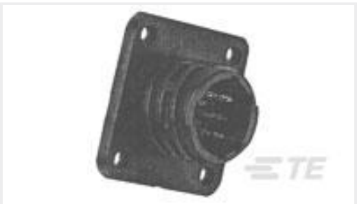
TE Part #205841-1 CPC RECPT ASSEMBLY SIZE 11-8