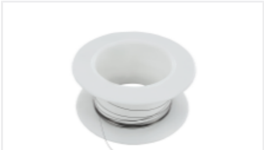
TE Part #R-12167-21 TC,MICRO,BIFILAR,T,44AWG,71.0L, POLYMER

Datasheets & Catalog Pages Miniature General Purpose AC LVDT English