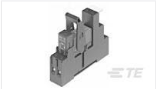
TE Part #4-1415073-1 RT3S4LC4