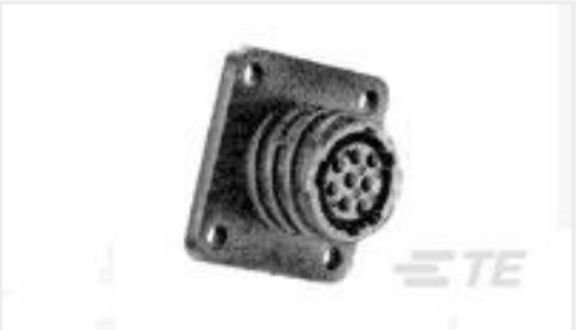
TE Part #206433-3 CPC RECPT ASSEMBLY SIZE 11-8