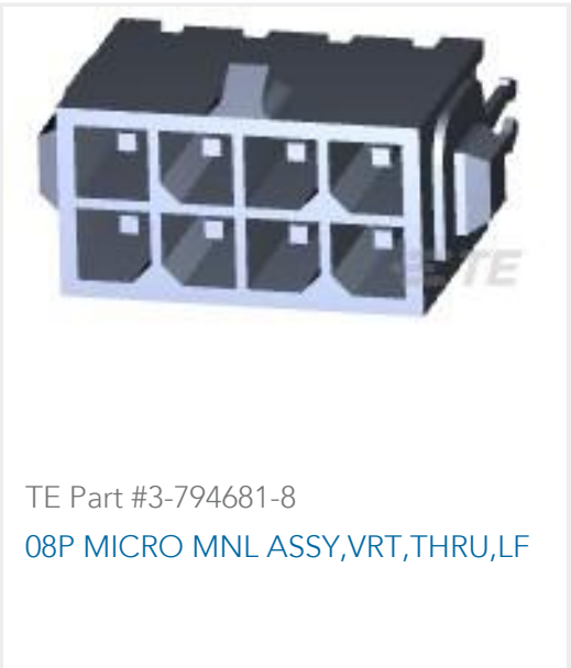
TE Part #3-794681-8 08P MICRO MNL ASSY,VRT,THRU,LF