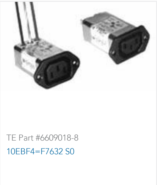
TE Part #6609018-8 10EBF4=F7632 S0