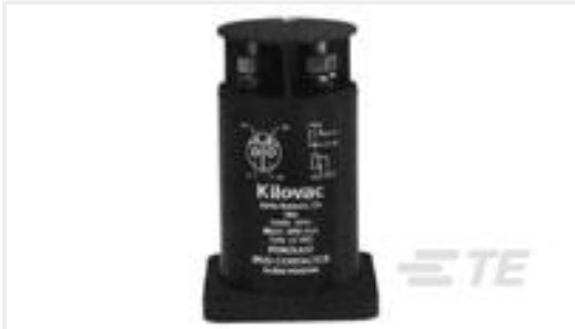
TE Part # 7-1618013-2 PD90XA57=RELAY, VACUUM, SPST-N