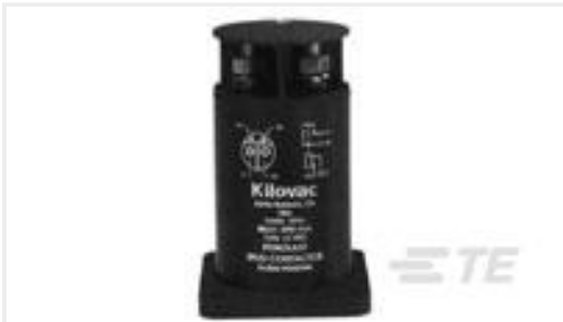
TE Part # 7-1618013-3 PD90XB57=RELAY, VACUUM, SPST-N