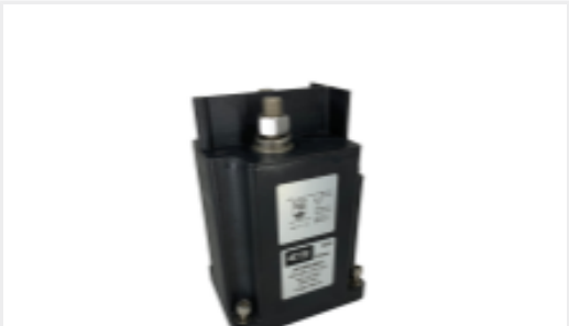
TE Part # 1-1618007-5 AP350XB57=RELAY, PRESSURIZED,