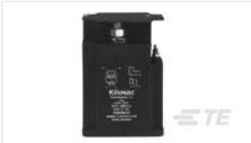
TE Part # 2-1618013-6 PD350XB57=RELAY, PRESSURIZED,