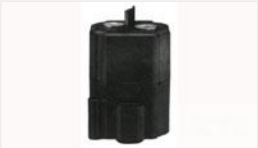
TE Part # 2-1618002-3 EV250-1B=RELAY, SPST-NO