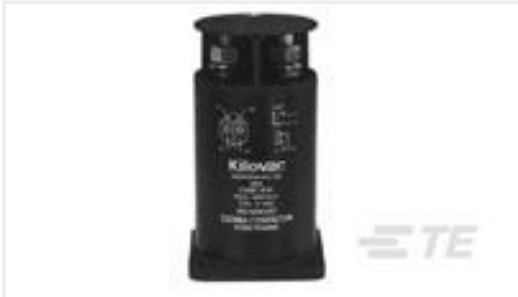
TE Part # 1-1618013-3 PD150XA57=RELAY, VACUUM, SPST-