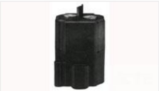
TE Part # 2-1618002-4 EV250-2A=RELAY, 12VDC SPST-NO