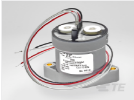
TE Part # 5-1618413-0 EV600HVNMM = CONTACTOR, SPST-NO 12V COIL