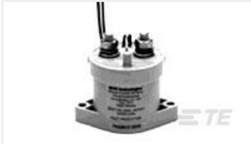
TE Part # 1618002-5 EV200AAACA=RELAY, EV200 SPST-N