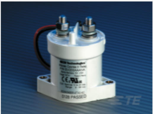
TE Part # 1618002-1 EV200A1ANA=RELAY,UN-ECON EV200