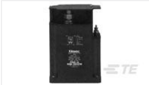
TE Part # 4-1618002-8 EV500-5A=RELAY, PRESSURIZED, S