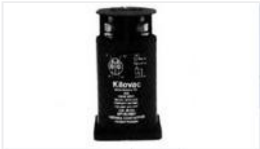
TE Part # 6-1618006-6 AP150XB57=RELAY, VACUUM, SPST-