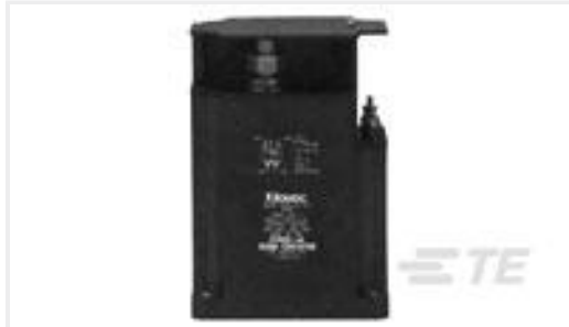
TE Part # 4-1618002-4 EV500-4A=RELAY, PRESSURIZED, S