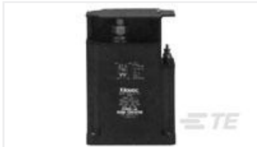
TE Part # 4-1618002-5 EV500-4B=RELAY, PRESSURIZED, S