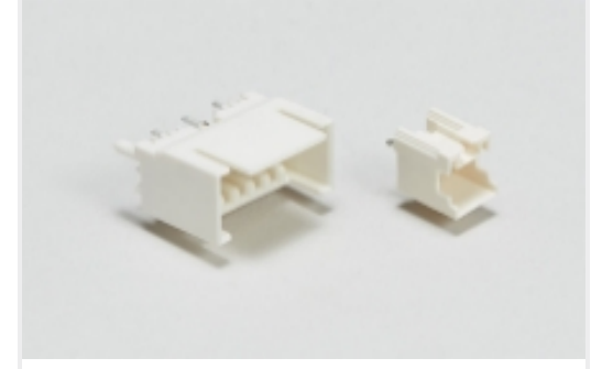
Wire-to-Board Headers & Receptacles (1)