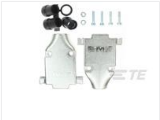
TE Part #5748676-2 DIE CAST CBL CLMP KIT,SZ 2