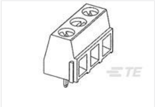
TE Part #282836-4 TERMI-BLOK PCB MOUNT 90 4P.