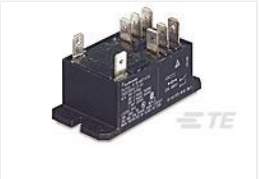
TE Part #9-1393211-0 T92S11D12-24