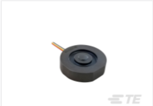
TE Part #CAT-FSE0006 Compact Compression Load Cell