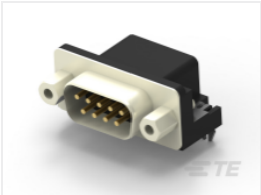
TE Part #2301843-2 AMPL PLUG HD20, R/A, 9P, B/L,4-40 S /LOCK