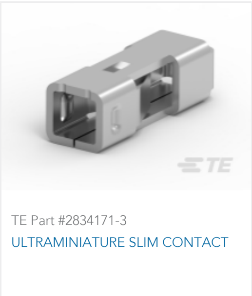
TE Part #2834171-3 ULTRAMINIATURE SLIM CONTACT