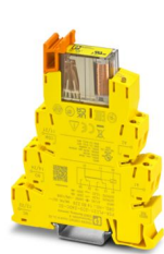
Safe coupling relay with force-guided contacts, electrically isolated, 2 changeover contacts, 1-channel, fixed screw terminal block, width: 14 mm

Please be informed that the data shown in this PDF document is generated from our online catalog. Please find the complete data in the user documentation. Our general terms of use for downloads are valid.