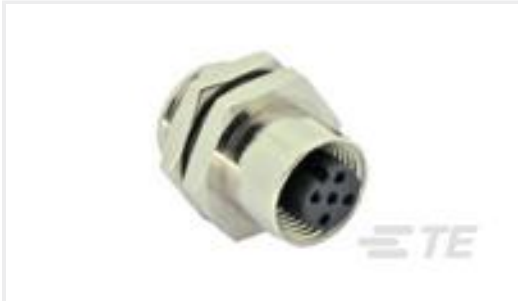
TE Part #1838891-3 M12 MtI FEMALE PNL CONN. Sldr Rear (Hex)