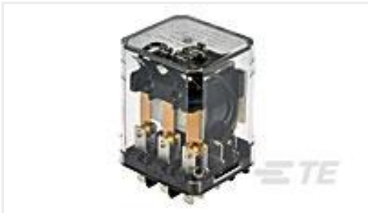
TE Part #3-1393118-8 KUP-14D55-24=KU