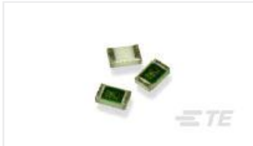
TE Part #1614917-1 CPF0805 2K2 0.1% 25PPM 5K RL