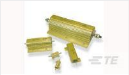
TE Part #7-1625971-8 HSA25 R10 5%